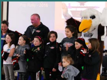
Pep Rally 2016